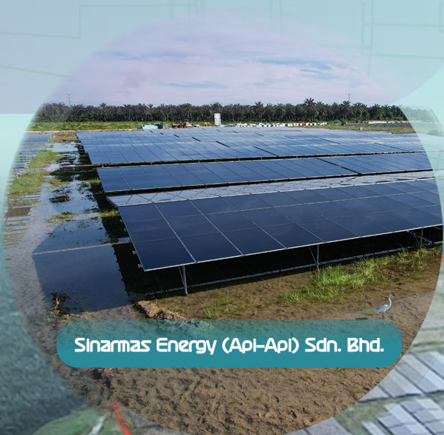
Sinarmas Energy (Api-Api) Sdn. Bhd.

LOCATION Manjung, Perak & Kuala Selangor, Selangor