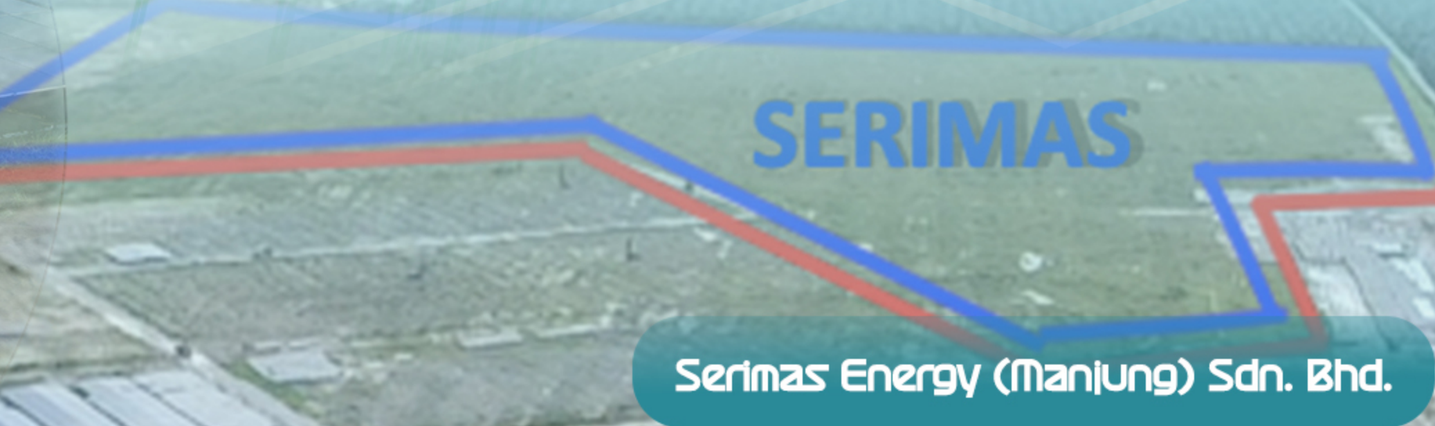
Serimas Energy (Manjung) Sdn. Bhd.