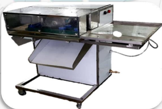
Automatic Fish Fillet Machine