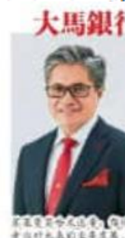
大馬銀行與MIDA助中小企業數字化業務

Penang applauds S.E.A virtual roadshow for fruitful insights on